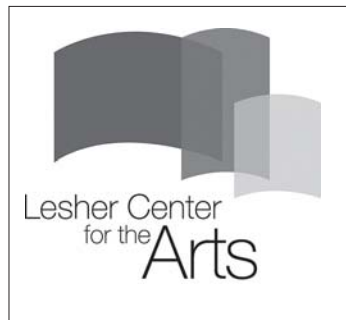
The Leshar Center's new logo (above) and the new website homepage.

"The launch of this website represents a new era for the Leshar Center for the