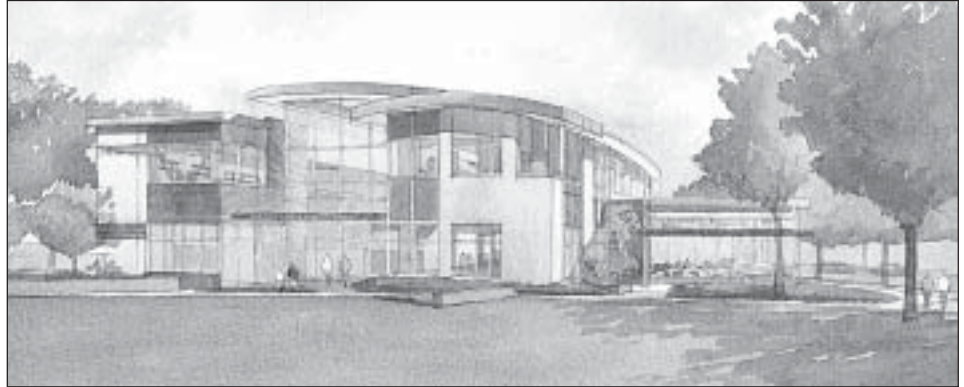
City officials plan on opening the new Walnut Creek Library in spring 2010.

Walnut Creek and Noceto became sister cities in September 1987 to promote a cultural relationship.