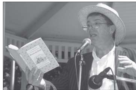
Audiobook recording artist Simon Vance reads a passage from A.A. Milne's "Winnie the Pooh" at LibraryFest.

Gifts of $100, $500, $1,000, $2,500, and $5,000 will garner recognition for donors at the new library. For details, call 925-935-5395 or go to www.newWCLibrary.org .