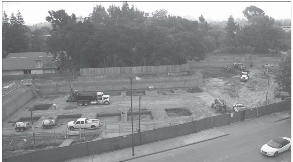
LIBRARY EXCAVATION COMPLETED — Workers finished excavating the new library's underground garage on September 26. Construction of the library is scheduled to begin in February and be completed in mid-2010.

newest store in 2010 on the site of the existing David M. Brian store at the southwest corner of South Main Street and Mt. Diablo Boulevard. David M. Brian is relocating to the former Gap store in the center.