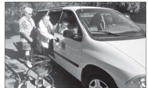
Walnut Creek seniors can get a lift from the City in one of its minivans.

"Older residents experience a good quality of life in Walnut Creek and most plan to stay in the community," the report concluded.