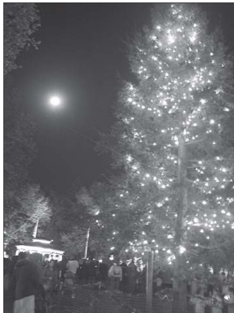
Hundreds of people turned out to Civic Park for last year's Holiday Tree Lighting.