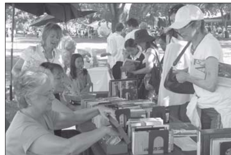
Members of the Friends of the Walnut Creek Library had brisk sales of used books to raise funds for the new library.