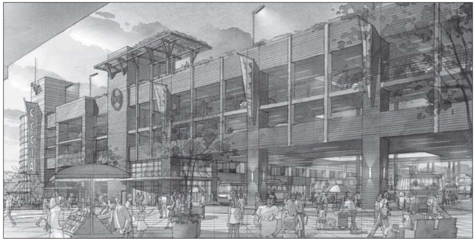
Artist's rendering of the bus center at the proposed BART Transit Village.

Stops along the way will include historic Borges Ranch, Shadelands Ranch