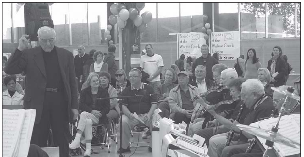
The Rossmoor Big Band performed for the "Thanks for the Memories" audience.

The organization accepts donations of books, CDs, and DVDs during open hours. Proceeds from the sale of these items will be used to purchase books for the new library.