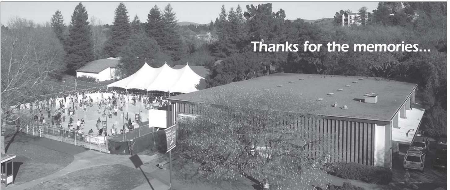
The venerable Walnut Creek Library and the popular Walnut Creek on Ice rink as they appeared on Jan. 13 — the library's final day of use.