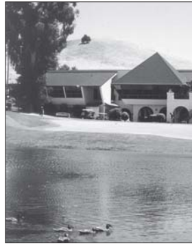
Boundary Oak Golf Course

City officials believe that a targeted capital improvement program is necessary