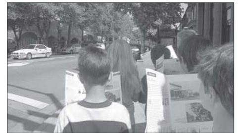
Third graders learning about historic district.

The organization is seeking applicants who have an interest in history and an aptitude for relating to children. Teaching experience is desirable but not required.