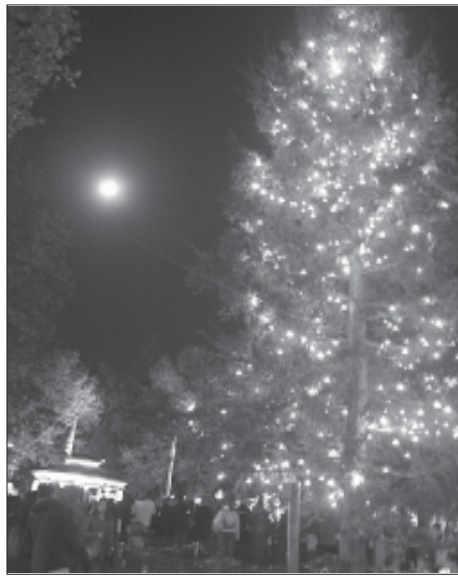
Glowing with promise for the season is the Holiday Tree at Civic Park.