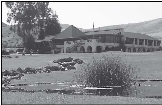
Boundary Oak Golf Course and its clubhouse are undergoing improvements under the guidance of a new management company hired by the City in July.

Recent enhancements in the golf shop and driving range are new carpet, updated merchandise, new range mats, balls and a ball machine.