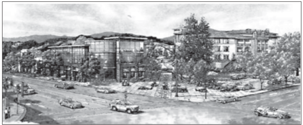
Plans for Centre Place, under construction at the corner of South California and Olympic boulevards, include improvements to the Alma Park entryway plaza.