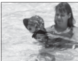
In progress: Aquatics needs assessment

2009 marked the first time in the 40-year history of Boundary Oak Golf Club that there has been a single operator for all aspects of operations. The community response has been positive, and golf rounds are up by more than 5 percent.