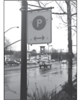
New, easier-to-read parking signs debuted over the holidays. Look for more in 2010.