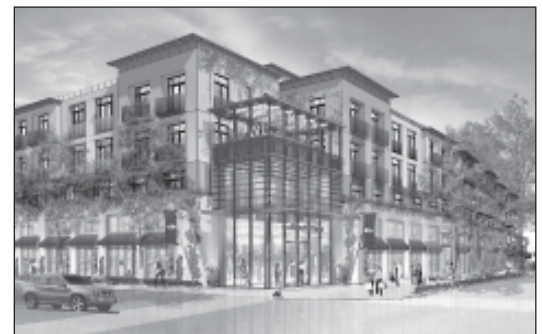
The Village at 1500 Newell, a mixed use, four-story project will include 49 condominiums and ground level retail is under review.

The health care sector is a bright spot with the expansion of John Muir Medical center, the continued success of Kaiser Permanente Medical Center and Children's Hospital East Bay's opening in Shadelands.