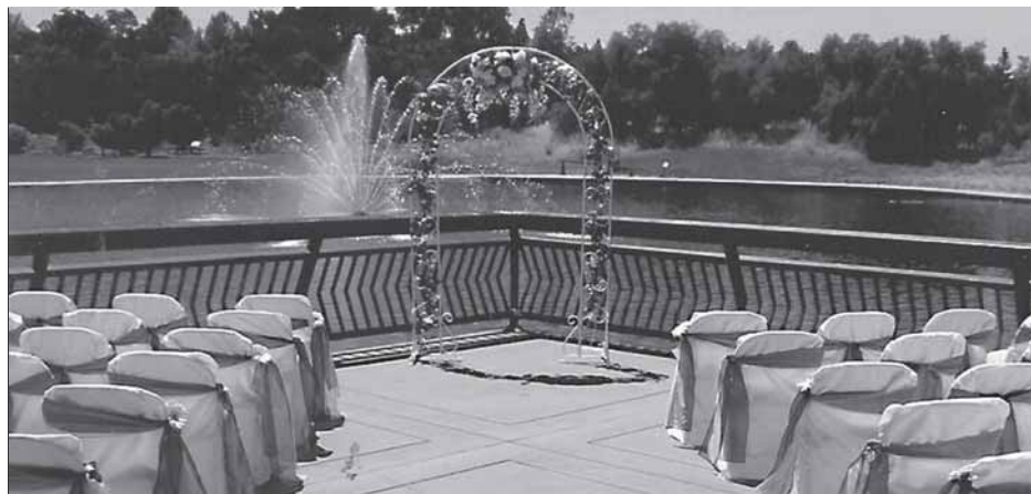
The Heather Farm Community Center’s lakeside patio ready for a wedding.