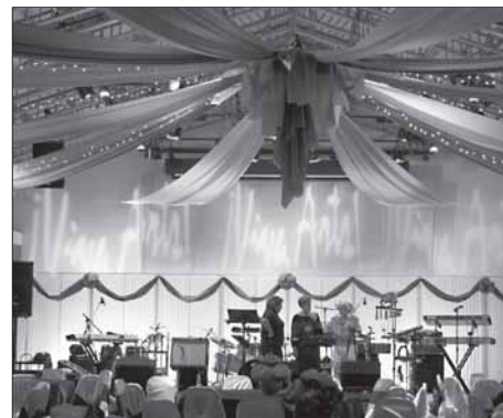
Shadelands Arts Center auditorium transformed for Viva Arts! celebration.