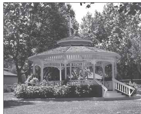
The classic gazebo at Civic Park.