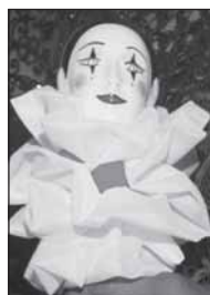
A distinctive, hand-painted Shellie Award

The 31 st annual Shellie Awards will take place Jan. 16 on the Hofmann Theatre stage at the Leshner Center for the Arts. The public is invited to join in this gala celebration to honor outstanding achievement in performing arts in Central Contra Costa County. Thirteen regional theatre companies participate in the black-tie event.