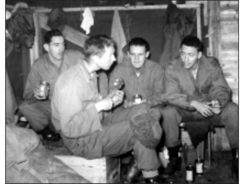
Walnut Creek TV is the City of Walnut Creek's government access channel. Its mission is to promote transparency in government and to build community through communication. Walnut Creek TV airs on Comcast Channel 28, (26 in Rossmoor), Astound Channel 29, and on AT&T U-verse Channel 99 under the menu option "Walnut Creek Television." It is also streamed live at www.walnutcreektv.org .