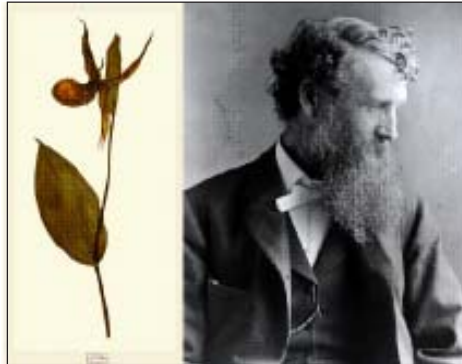
Naturalist John Muir is the subject of the upcoming exhibition at the Bedford.