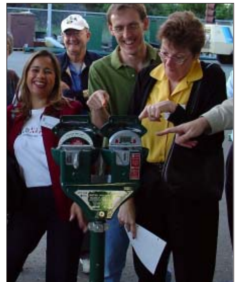
Even parking meters can be fun, as these Citizens Institute members discovered while visiting the Traffic Operations Center.